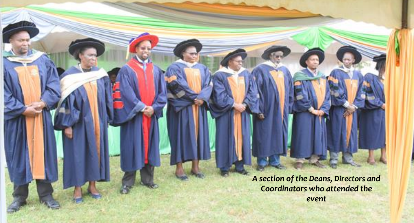
A section of the Deans, Directors and Coordinators who attended the event

The DVC (ARSA) articulated six tips that, if the students followed, would enable them to stay well at the University. These include trusting in God and living by the standards of the scripture in Proverbs 3: 5-6, following University rules and regulations and prioritizing their activities with academics being at the top of the list.