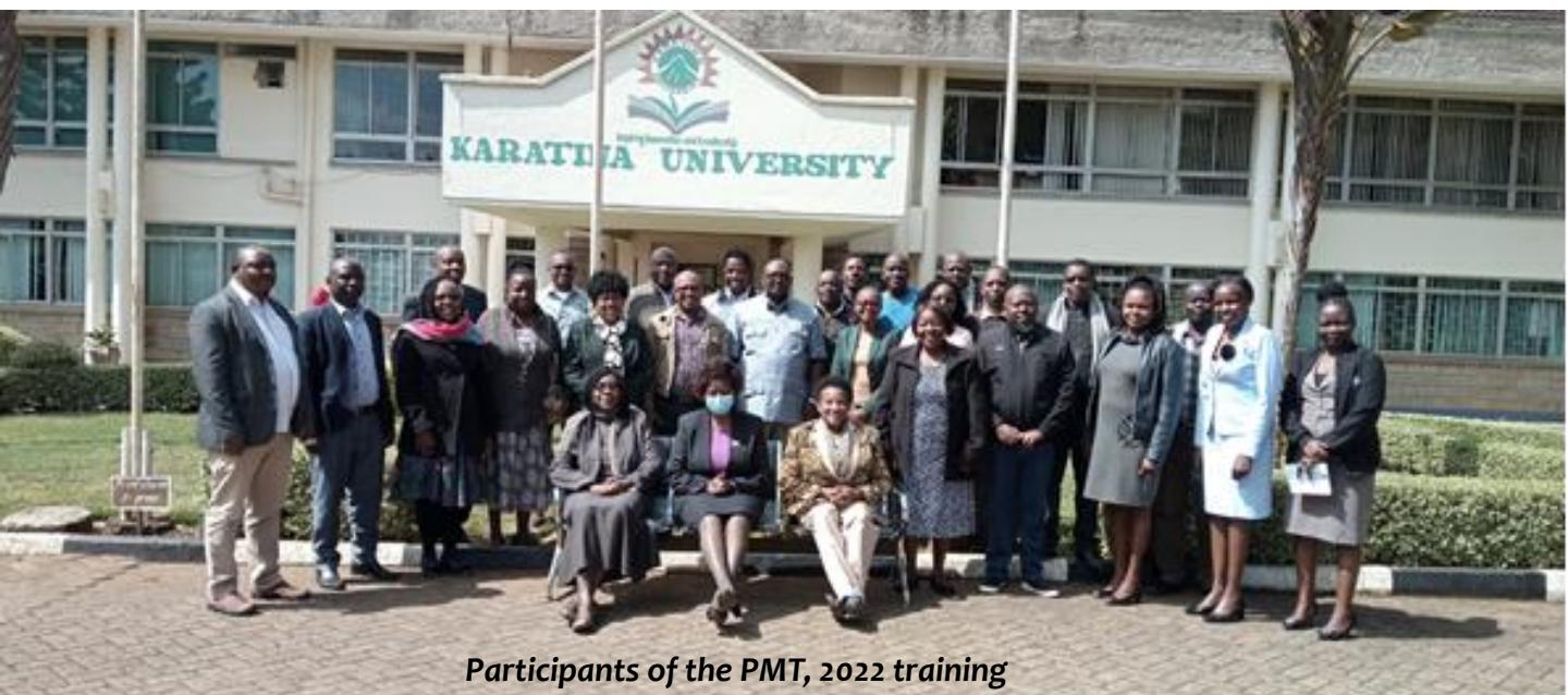
Participants of the PMT, 2022 training

Participating universities in this project are from Kenya: Karatina University, Kenyatta University, Taita Taveta University, Mt. Kenya University, Kibabii University, South Eastern University of Kenya, Chuka University, KCA University and Technical University of Mombasa. From Uganda: Kyambogo University, Mbarara University of Science and Technology, Lira University and Uganda Martyrs University. From Tanzania: Mzumbe University, Arusha Technical College, University of Dodoma, Mbeya University, Mtwara University College and St. John's University of Tanzania.