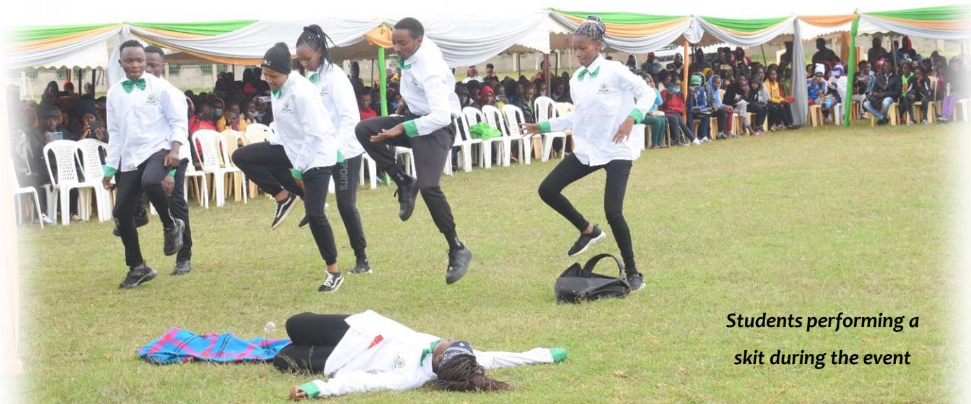
Students performing a skit during the event

The Senate develops curricula which are, then, sent to the Commission for University Education (CUE) for approval before implementation. The Senate further develops policies which are taken to Council for approval. These policies, then, regulate actions and functions within the University.