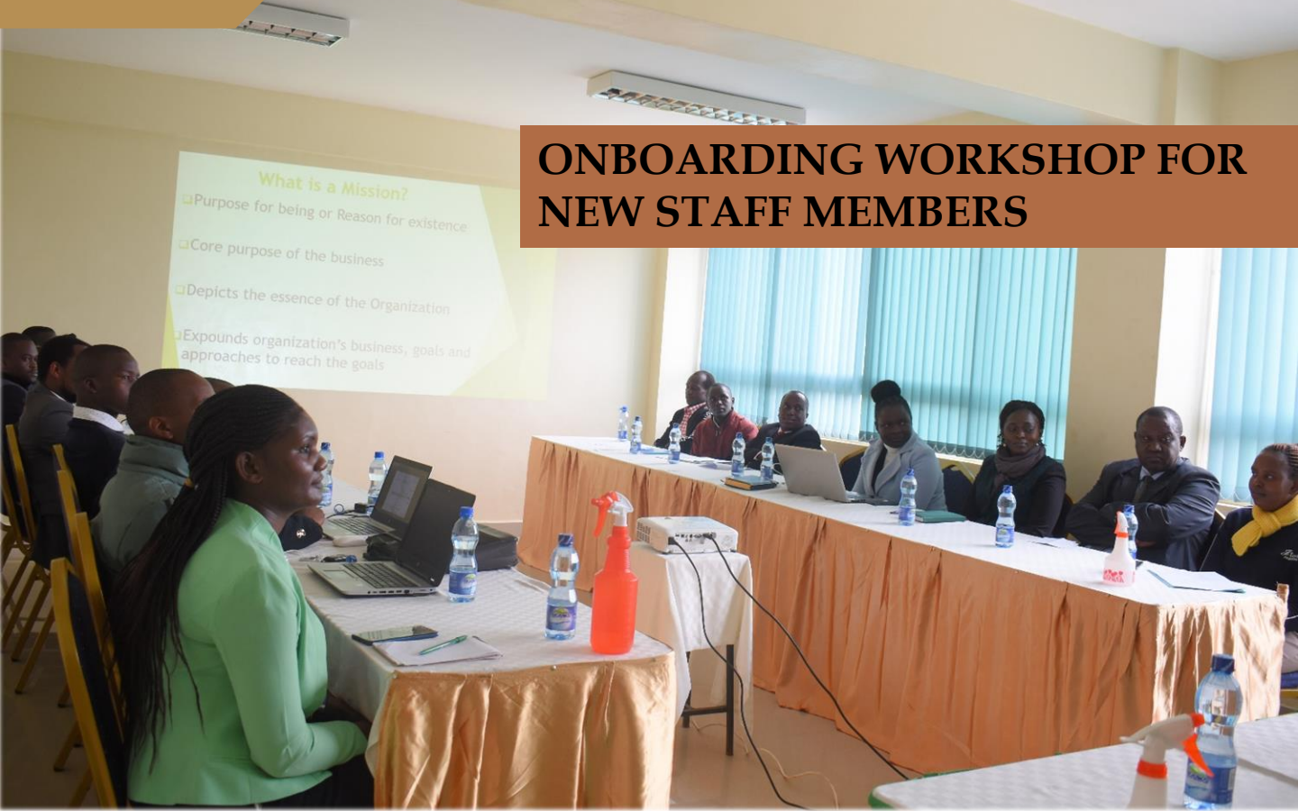
Newly recruited staff keenly following the presentation