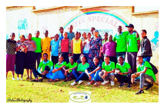
Nature Club members with some of the children

Cheerful Special Home is a charitable institution started in 2005 by two volunteer teachers who, by virtue of their profession, realized the problems children with mental handicaps from low-income families and orphans were undergoing. The Home cares for, supports and provides quality services to mentally disabled children to be productive and valuable members of society.