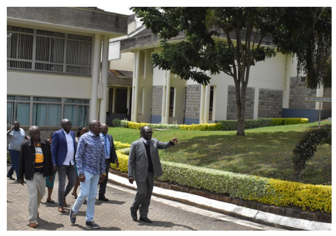
On a tour of the University

The MP, on his part, stated that the access road to the University, which is currently under construction, has been catered for in the supplementary budget. He further noted that the Government had committed itself to ensuring that all stalled projects are completed. On the issue of land, the MP committed to engage in public participation with relevant stakeholders as viable options are pursued.