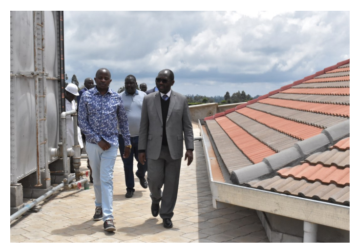
Tour of the Library

The MP, on his part, stated that the access road to the University, which is currently under construction, has been catered for in the supplementary budget. He further noted that the Government had committed itself to ensuring that all stalled projects are completed. On the issue of land, the MP committed to engage in public participation with relevant stakeholders as viable options are pursued.