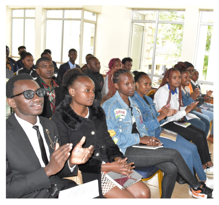
A section of the students following the proceedings at the Conference Hall

The Tax Society Club students were appointed as ambassadors of the Tax Education Society and were tasked to introduce tax awareness activities in the University and in Central region, participate in competitions organized by KRA to show case tax innovations, hold tax debates, lectures and symposiums and engage in community outreach activities in the Central region.