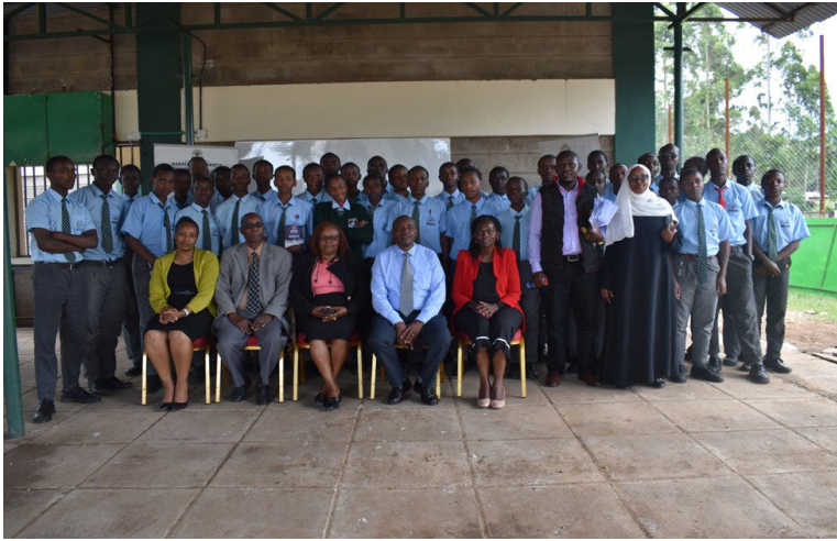
The Karatina University Career Talk Team pose for a photo with the Kanjuri High School students.