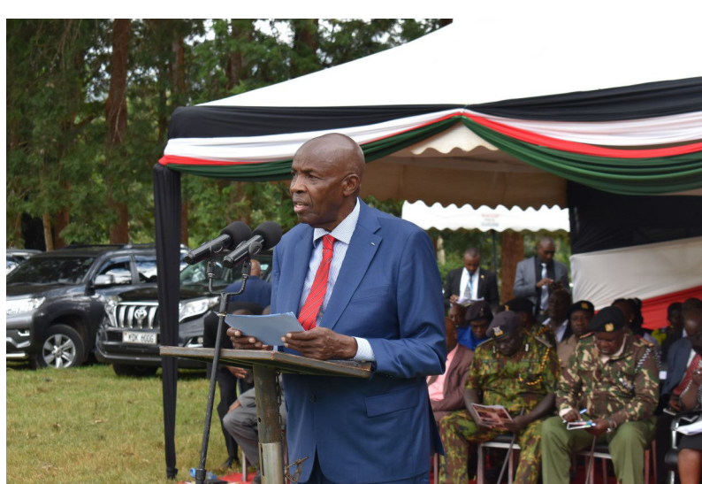
The CS Hon. Machogu addressing the audience

Speaking during the event Hon. Machogu appreciated the efforts that the education stakeholders have put in place to ensure that academic excellence throughout the region.