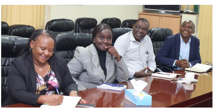
The team for Karatina University keenly following the meeting proceedings

TBK officials expressed appreciation for Karatina University's commitment to strengthening the partnership and acknowledged the existing memorandum of understanding (MOU) between the two institutions. They emphasized the importance of revisiting the MOU to enhance collaboration for the benefit of stakeholders in the tea sector. TBK reiterated its readiness and willingness to work closely with Karatina University to drive positive change and innovation in the industry