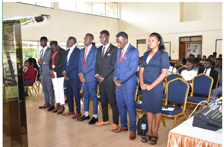
The elected student leaders during the swearing in ceremony