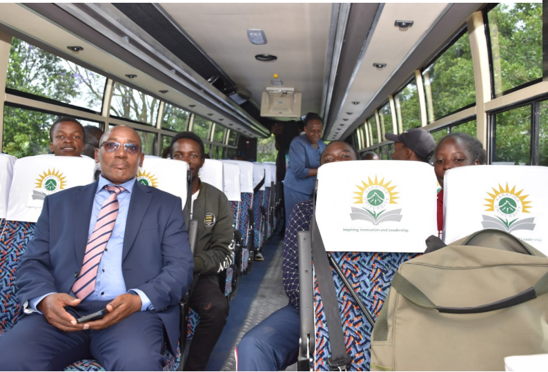
The VC shares a few moments with the students in the Bus and after the swearing in Ceremony of the Student Governing Council