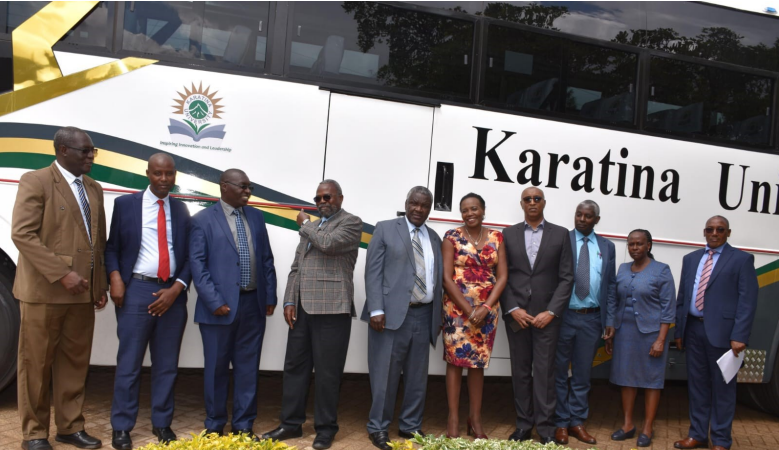
Members of the Karatina University Council pose for a photo after receiving the bus.

curricular, and administrative activities. The university community expressed their gratitude to the leadership for prioritizing infrastructure development to support the institution's goals.