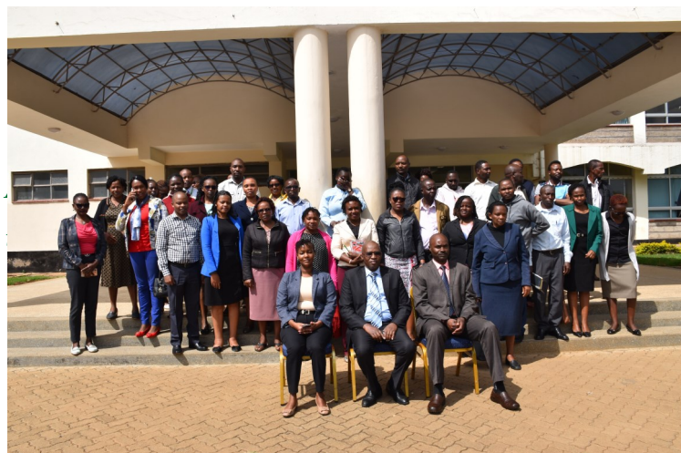
The members of staff pose for a group photo with the EACC facilitators (sitted) after the training

Staff members keenly following the training proceedings.