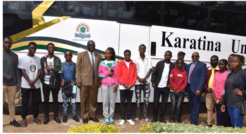
The excited students pose for a photo with the new bus