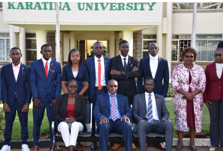
Student leaders pose for a group photo with the VC after the swearing in ceremony