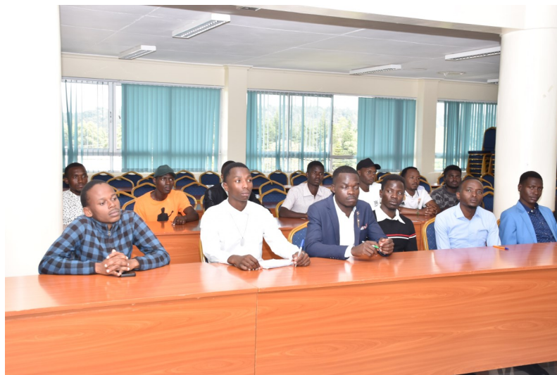
The students and students keenly following through the presentations during the training.

Karatina University remains committed to fostering a culture of accountability, transparency, and ethical behavior among its community members. This collaboration with EACC demonstrates the institution's dedication to upholding the highest standards of integrity and leadership.