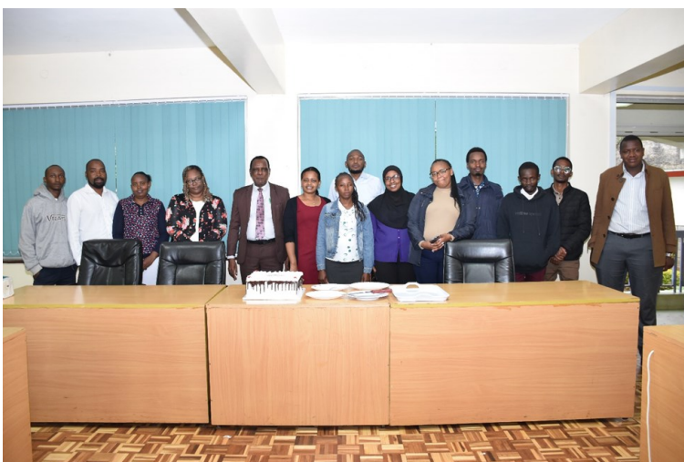
The interns pose for a group photo with the Registrar and Human Resource team after the session.

Additionally, the team had a practical driving session using the university's new vehicles to apply the skills learned in real-time scenarios.