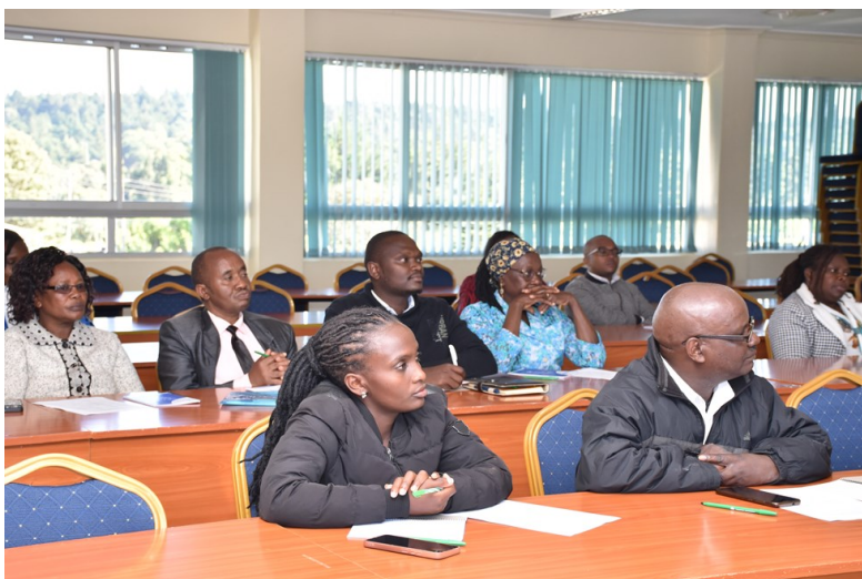
The participants keenly following the presentations during the capacity building workshop.

care of and consistently reminded of the right path to take in their personal and academic journeys.