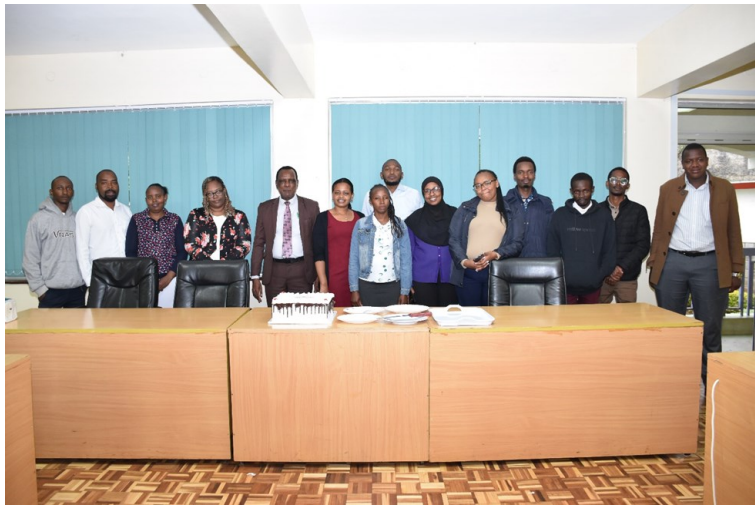
The interns pose for a group photo with the Registrar and Human Resource team after the session.

As a token of appreciation, the interns were awarded gifts, recognizing their efforts and contributions to the university. They expressed gratitude to Karatina University management for the opportunity to gain hands-on experience and enhance their professional skills.