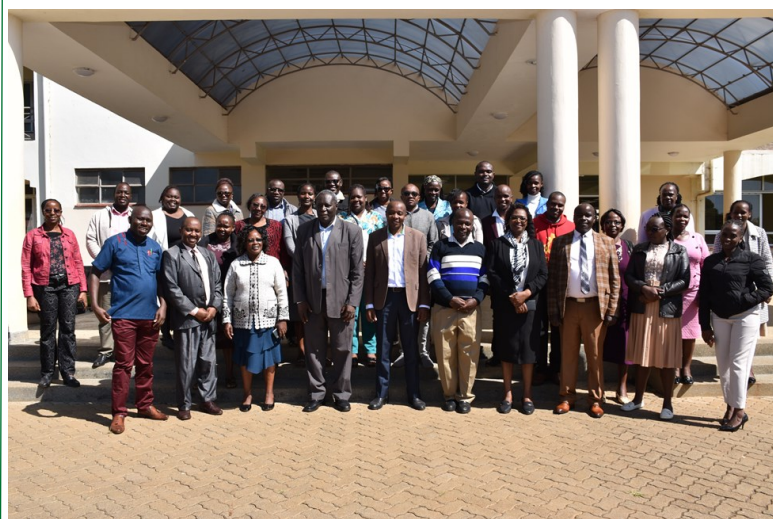
The guidance and counselling teachers pose for a group photo with the Deputy Vice Chancellors and the organizing committee during the workshop.

The workshop provided an opportunity for discussions on best practices in guidance and counseling, strategies for addressing student challenges, and ways in which Karatina University can continue collaborating with schools to enhance student support systems. The university reaffirmed its readiness to work closely with schools in Mathira East to provide mentorship, training, and resources that will empower both teachers and students.