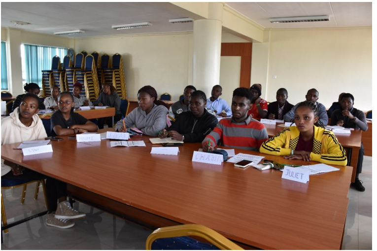
Participants keenly following through the presentations during the workshop

Main Campus, brought together students, staff, and NACADA officials for a series of powerful discussions, training sessions, and action planning aimed at empowering young people to take an active role in combating drug and substance abuse within their communities.