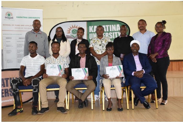
The winning teams pose a photo with the organizing committee after awarding of certificates.

ing innovators whose projects demonstrated creativity, sustainability, and potential for real-world impact. The recognition of these students not only celebrated their achievements but also encouraged a culture of innovation, resilience, and leadership among the youth.