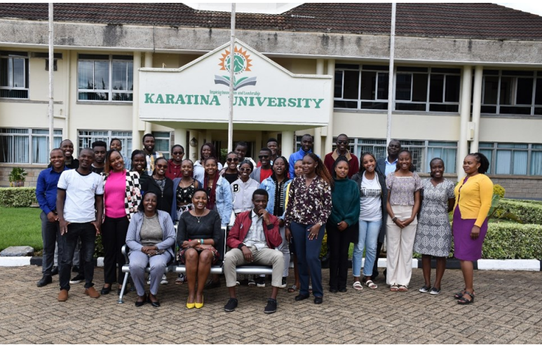
The students pose for a photo with the team from NACADA and organizing team from Karatina University.

The sessions were highly interactive, featuring experience sharing, group discussions, role-playing, and practical workshops designed to equip students with the tools and confidence to spearhead the anti-drug campaign. Students were encouraged to take leadership in preventive efforts and be ambassadors of healthy living. The representatives from NACADA emphasized on the urgent need to engage the youth meaningfully in national strategies against drug and substance abuse, highlighting that prevention is more sustainable and cost-effective than rehabilitation and treatment.