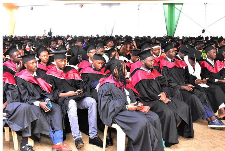
Congratulations to the Class of 2025!

that bring global opportunities to Karatina University.