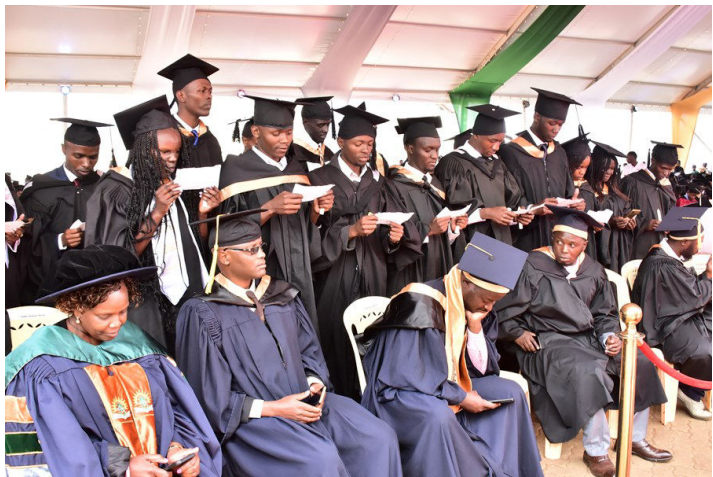
Graduands during the 13 th Graduation Ceremony

The dual celebration — the installation of the 2nd Chancellor and the 13th Graduation — marked a defining moment for Karatina University. It signified continuity, renewal, and a shared vision for the future: to nurture excellence, integrity, and leadership that transforms communities and the nation.